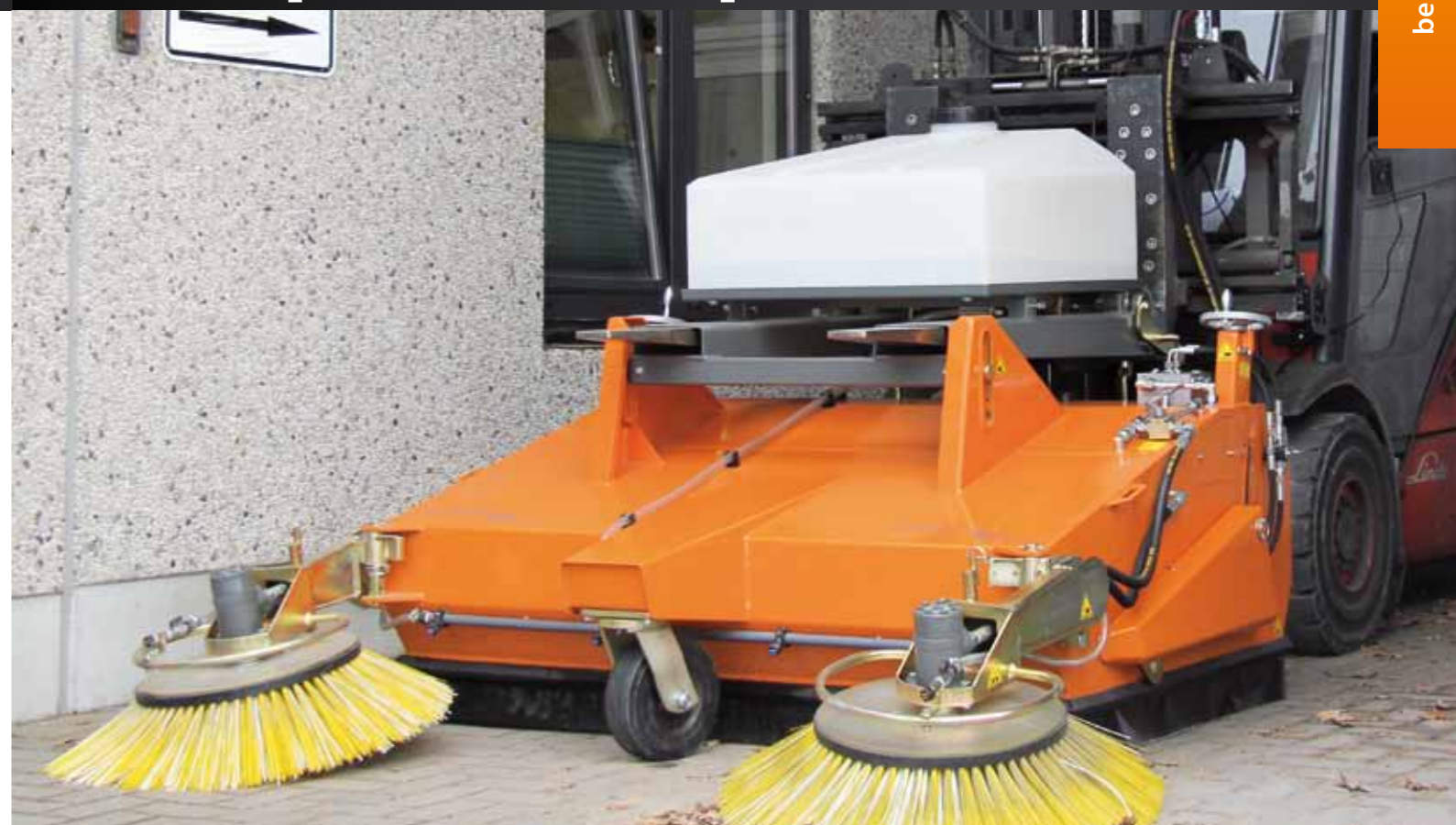
Hydroblock includes all power units for the control of all functions.