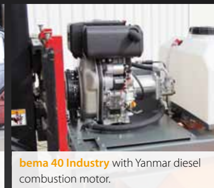
bema 40 Industry with Yanmar diesel combustion motor.