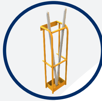
Strip Light Bulb Holder

Keep tools safe and secure whilst working at height