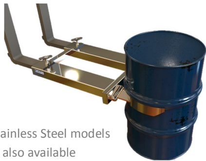
Stainless Steel models also available

Our best selling drum handler has a fully automatic action. The attachment has two curved arms which hinge at one end. To lift a drum, approach it with the clamp arms horizontal and positioned halfway up the drum, between two rolling hoops. When the arms contact the drum they will open automatically, falling back around the drum as you proceed forwards. When the attachment is raised the arms will grip the drum tightly under the upper rolling hoop.