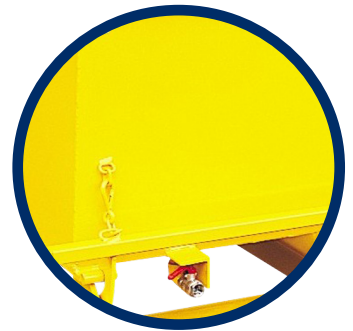
Drain Tap & Filter

Allows skip to be lifted by overhead crane