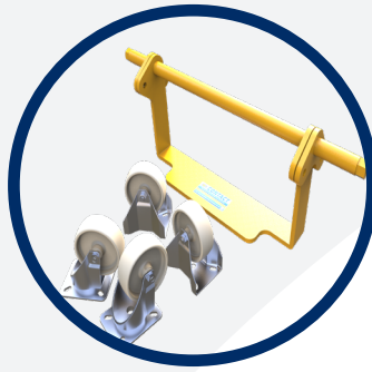
Auto Release Kit

Contain rubbish and control unwanted odours