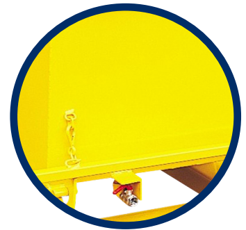
Drain Tap & Filter

Allows skip to be lifted by overhead crane