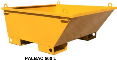
PALBAC 500 L