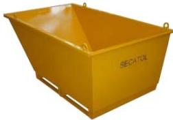
PALBAC 1000 L