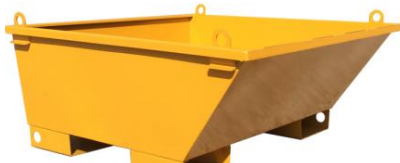
PALBAC 500 L