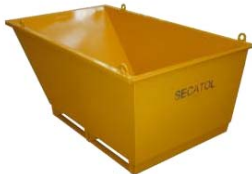
PALBAC 1000 L