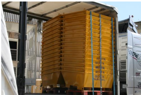
30 PALBAC stacked in a lorry