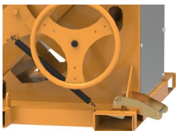
Fork locking system

Use: The ELEV concrete skips are rectangular skips with large side discharge section. Thanks to its design, the ELEV skip has a lower height than other skips of the same capacity.