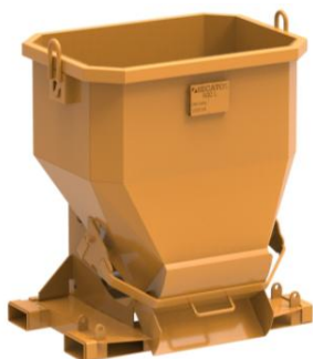
Model ELEV V2 VH 600L