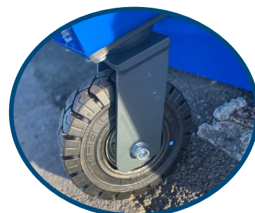
Heavy-duty wheels & castors