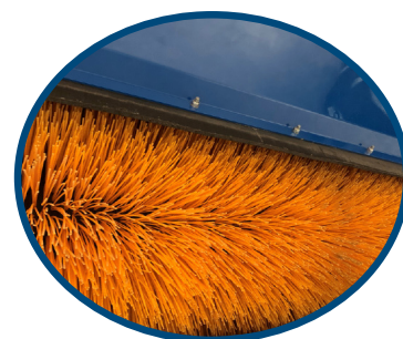
Brushes made from 100% recycled plastic