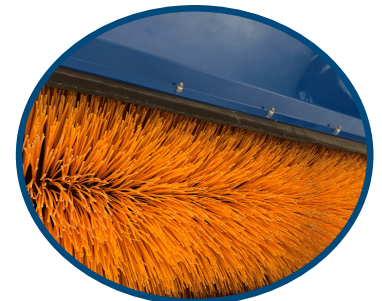
Brushes made from 100% recycled plastic