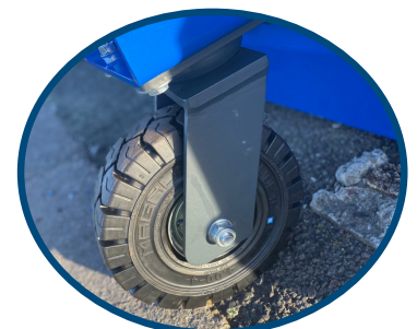
Heavy-duty wheels & castors