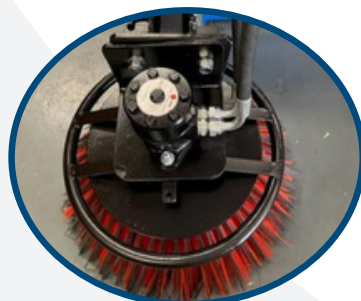
Optional side brush