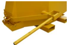
Levier en position avant