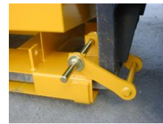
Safety locking system